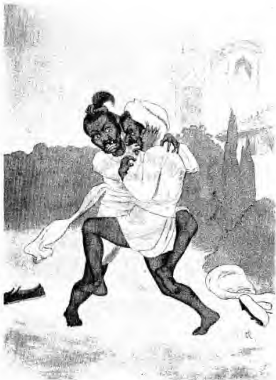
"They fought for a year in the stomach of the mosquito."